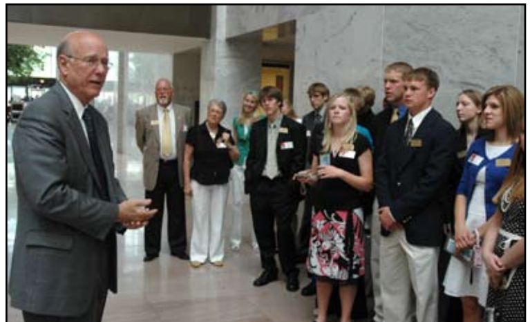
Senator Roberts visits with the Kansas delegates during the Electric Cooperative Youth Tour on June 12 in Washington, DC.

To see the photos from this year's tour or to learn more about the program, go to www.youthtour.coop .