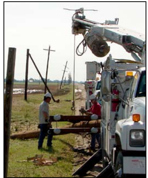
Midwest Energy linemen repair damaged poles following the June 22 nd storm.

On June 5, 80-100 miles per hour winds ripped a grain storage bin from its foundation and threw it into Midwest Energy's 34.5 kV line at the Turon Substation, knocking off electricity to