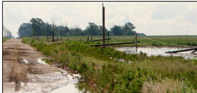
The June thunderstorm brought down more than 50 poles. Linemen worked in very wet conditions to restore services.

Several media outlets, including three Wichita television stations, reported