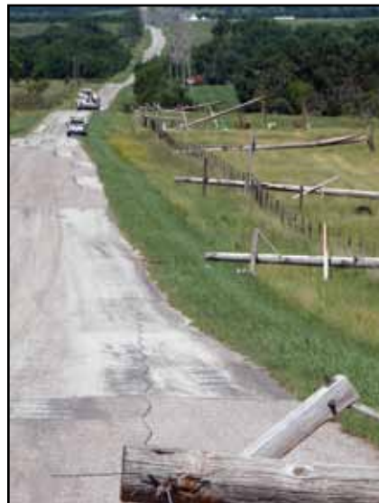
By re-routing power, Caney Valley linemen quickly restored power to its members following the June 27 storm.

The cooperative lost 22 poles on the 69KV transmission line running west of Cedar Vale. This line also contained a three-phase distribution underbuild that went down. In addition, the cooperative lost 10 three-phase distribution poles and experienced several other smaller storm-related problems. Early damage assessments