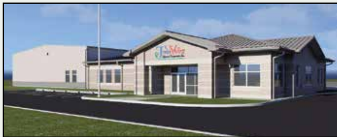
Above: an artist's rendering of the proposed facility for Twin Valley.

A couple of years ago, Twin Valley purchased property at