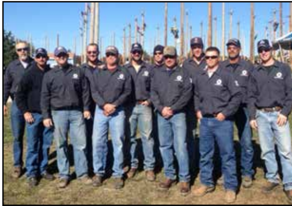
Midwest Energy sent three teams to the International Lineman's Rodeo in Bonner Springs on October 19. The teams had nearly perfect scores.